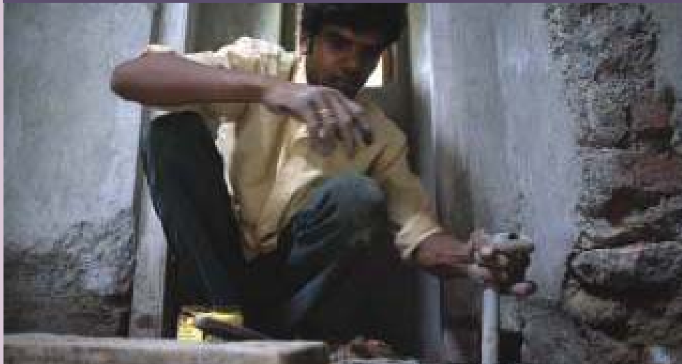
Trained by Aajeevika Bureau, a plumber at work in Udaipur