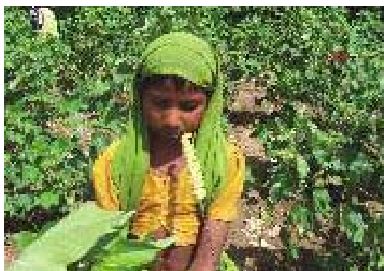
Girl child on BT cotton seed farm where the unionized efforts of DRMU through Prayas, Rajasthan are being actioned

It is evident that even the Government has begun to give attention to the urban sector through the Jawaharlal Nehru National Urban Renewal