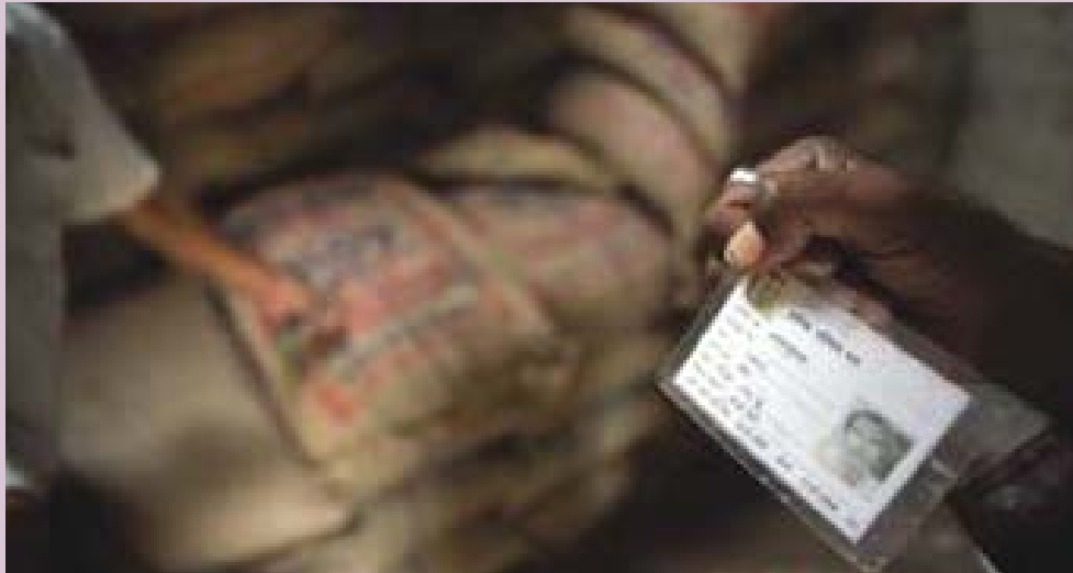
Identity card provided by Aajeevika Bureau