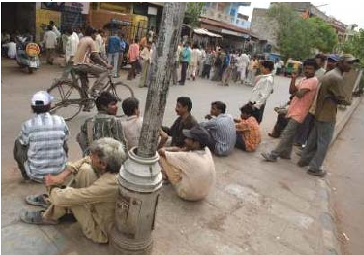
Labourers awaiting work at a 'naka' in Ahmedabad

The Union has used the vast network of labour workers to organize labour supply. The initiative achieved dramatic success in the migration stream of BT cotton seed farms where it was possible to increase wages by 40-50 percent over a period of two years for a workforce of around two hundred thousand workers. Efforts are on to replicate this success in other migration streams. Ultimately the model seeks to develop a wage labour exchange that would mediate between demand and supply.