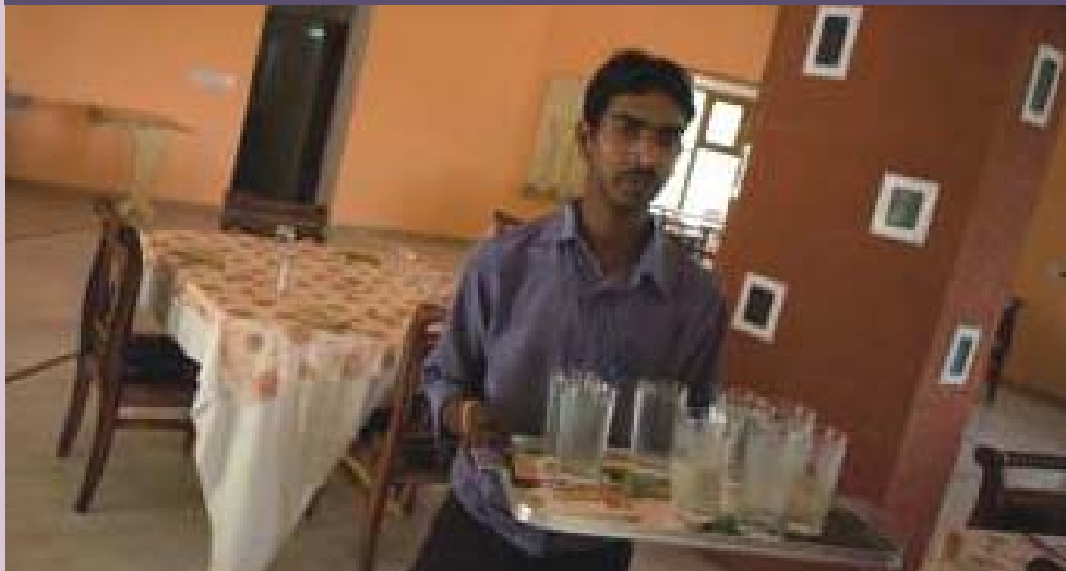
Confident rural youth now working in an Udaipur hotel, placed by Aajeevika Bureau