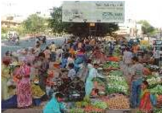
Market at Mansi Complex Satellite, Ahmedabad, where vendors are organized and facilitated by Mahila Sewa Trust

these locations in the identified thrust areas and the possibility of supporting them. In 2007-2008, the Trusts have disbursed Rs 39.74 million through 26 projects.