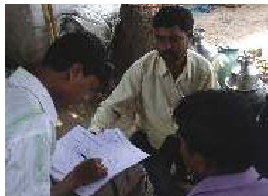
Socio-economic survey being conducted in Sangli, Maharashtra by Shelter Associates

There is certain skepticism on the degree to which Municipalities can be influenced to approach urban planning in a professional and participatory way. This stems from the fact that many of the Municipalities are known to be both corrupt as well as politicized. Therefore all efforts made to produce a cadre of professionals to address urban issues would not bear fruit