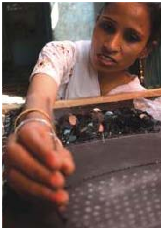
Working at the SEWA Centre, New Delhi

Mission (JNNURM) and has begun to look at urban health as an important factor to be addressed through the introduction of the National Urban Health Mission.